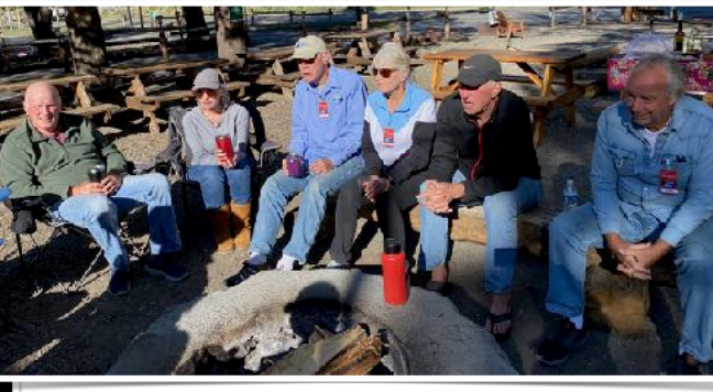
Pismo Vintage Trailer Show, Pismo Coast Village RV Resort